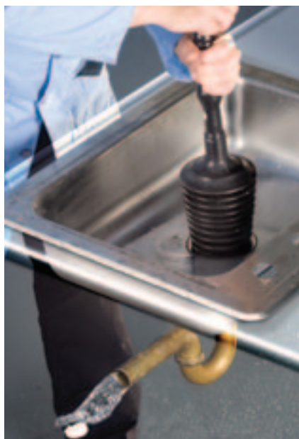
MAIN SQUEEZE In our tests, the Master Plunger WP500, $6, effectively forced out clogs and is among the better alternatives to chemicals.

Crystals, another type of chemical drain cleaner, attacked clogs with a fury. But if the crystals are exposed to aluminum, a common material in some older sink trim, they can generate a choking cloud of lye-laden gas. Plus, mixing these products with different chemical drain cleaners or with common household cleaners, especially those that contain